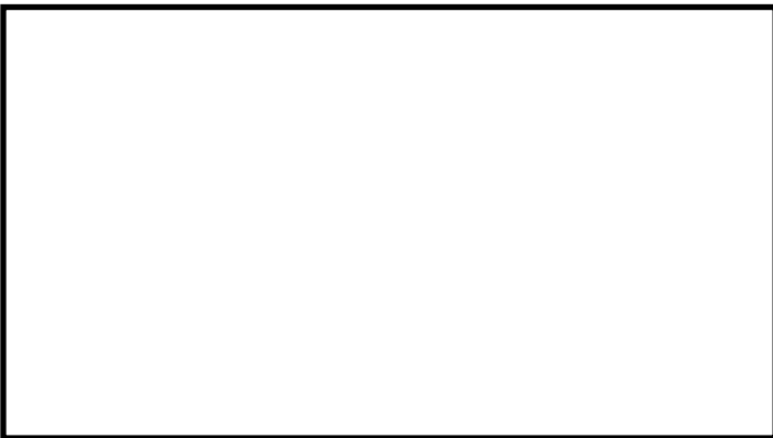
Use this proportion to sketch 1/2 or 1/8 page layouts

Print area of 1/2 page ad is 8 1/2 x 4 3/4 inches Print area of 1/8 page ad is 3 3/4 x 2 1/2 inches