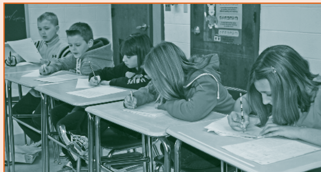
Next year will be the third consecutive year that New York's public schools will see a decline in state aid. As a result, $2.7 million in budget reductions were made in the proposed Mohonasen budget for 2011-12.

Also on May 17, voters will decide on a bus proposition, and elect two candidates to the Board of Education (see page 8).